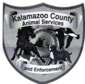
Kalamazoo County Animal