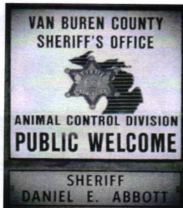
Van Buren County Animal Control